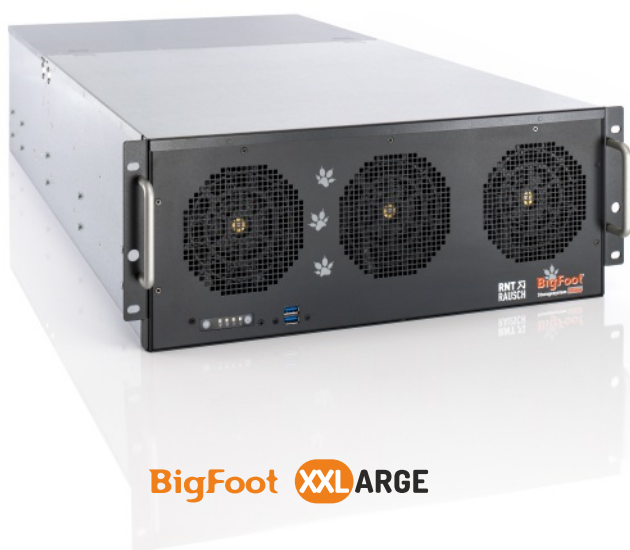
BigFoot XXL ARGE