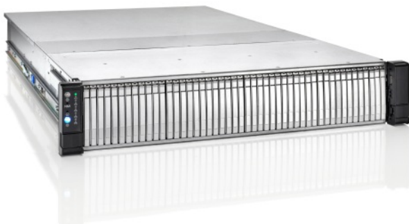
BigFoot FLASH 2/52