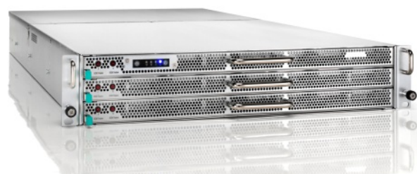
BigFoot L ARGE